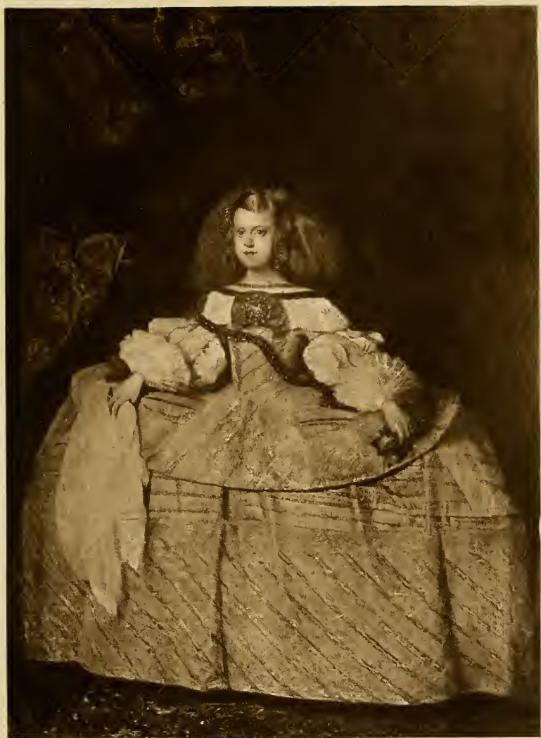
Infanta Maria Theresa. wife of Louis XIV